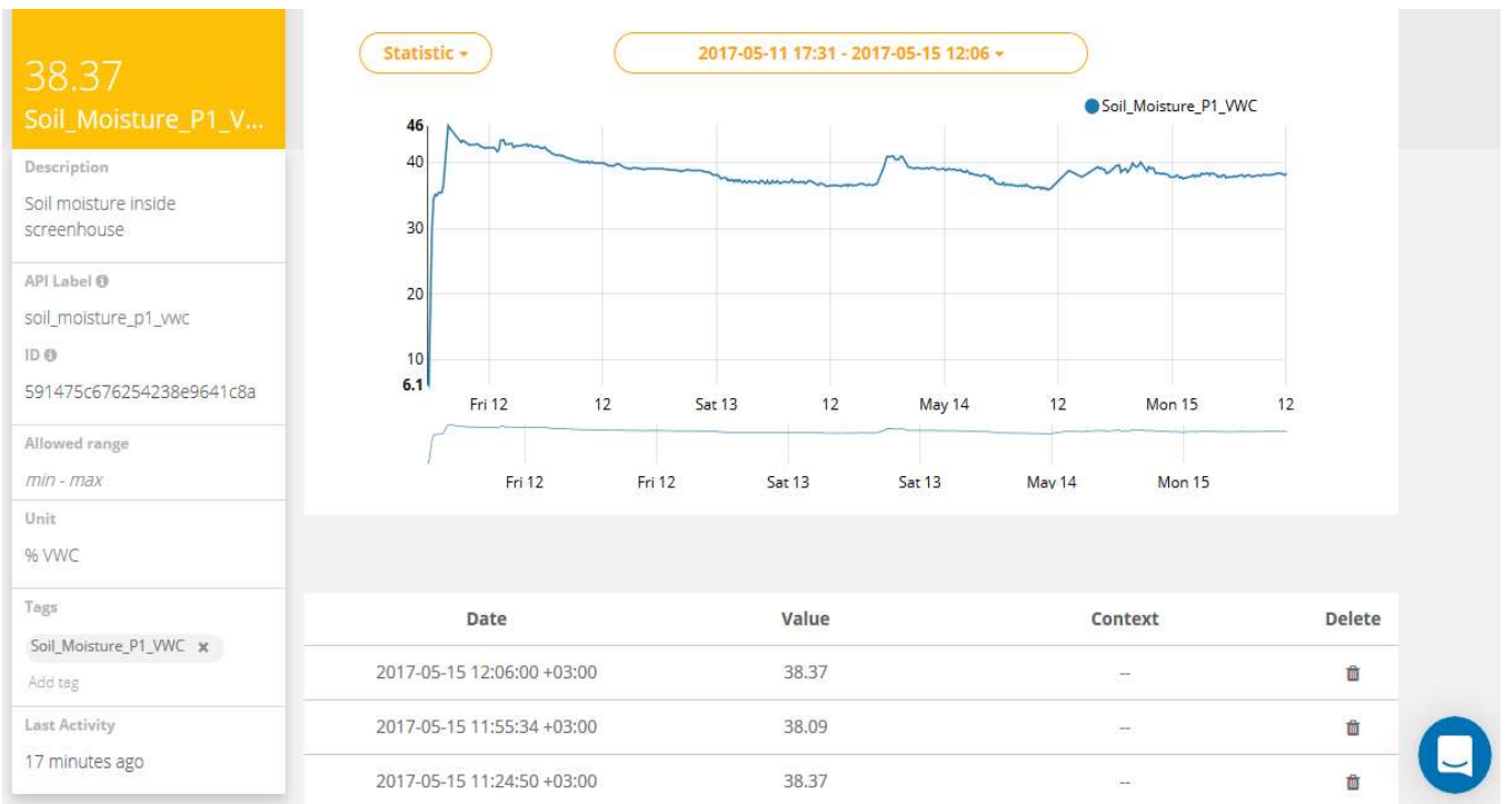
Screenshot of the data stream showing soil moisture trend inside a screen-house.